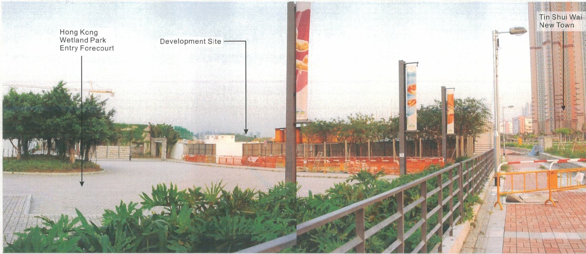
Year 1 of Operational Phase with landscape mitigation measures View southeast from the Hong Kong Wetland Park Entry Forecourt (VSR13)