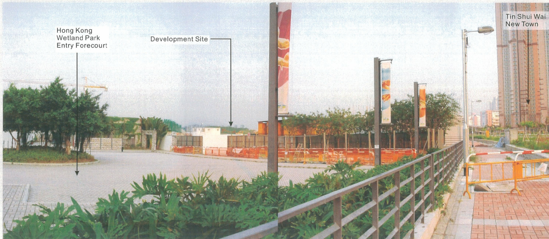
Year 10 of Operational Phase with landscape mitigation measures fully established View southeast from the Hong Kong Wetland Park Entry Forecourt (VSR13)

CH2M HILL Hong Kong Limited In association with RPS ADI Limited Archaeological Assessments MVA Hong Kong Limited